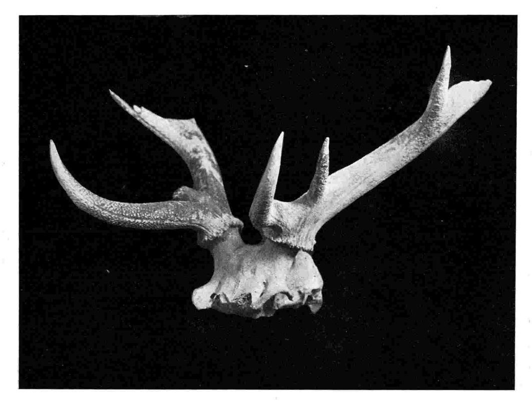
Fossilized Antlers from the Red Crag, Bawdsey. Jan., 1930.